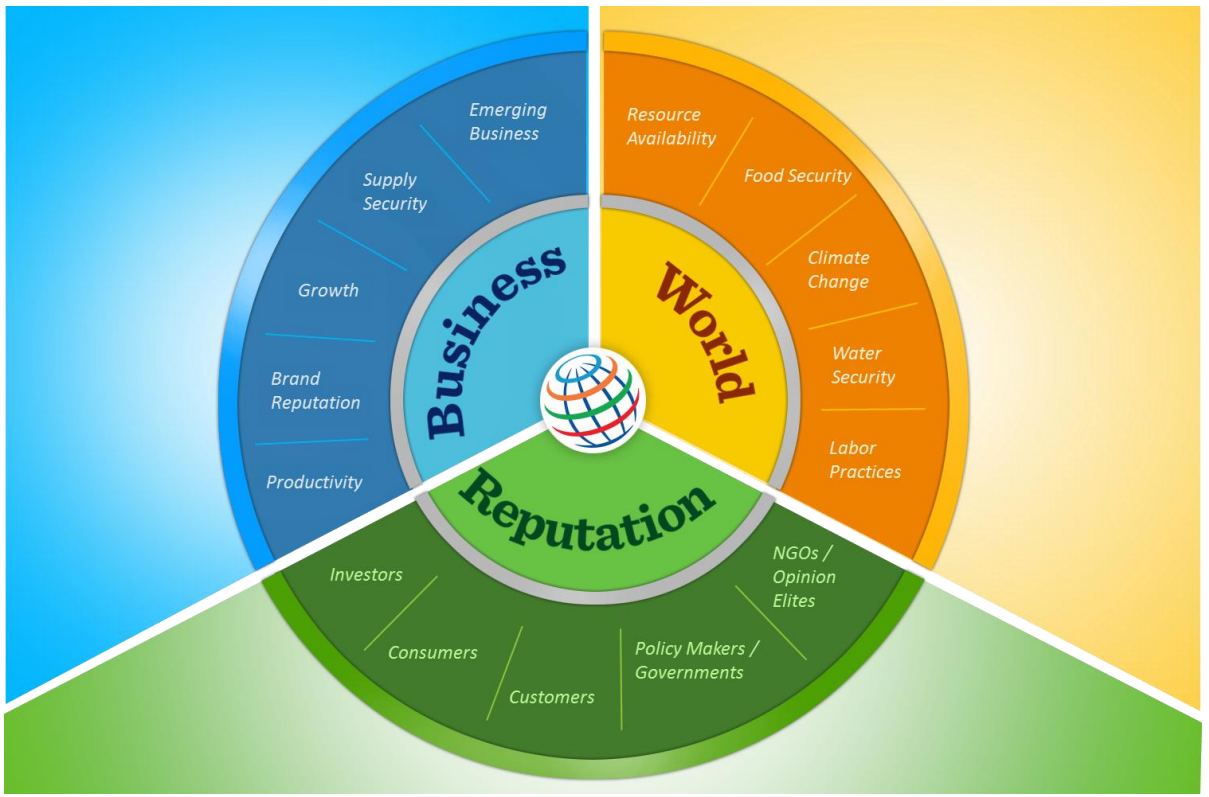
Figure 1: Agriculture sits at the nexus of three critical agendas: Business Impact, World Relevance and Corporate Reputation

Agriculture is the foundation of the food system and the root of PepsiCo's business. To make our beverages and convenient foods, we use more than 30 agricultural crops and ingredients from approximately 60 countries. Agriculture contributes to many of the urgent environmental and social challenges we face around the world but can also be a solution.